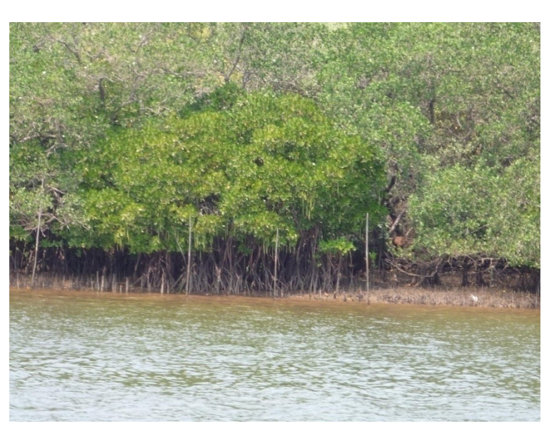
Figure 3. Mangrove forest in Tamil Nadu, India. Mangrove roots provide a tangled underwater habitat for many marine species.

Mangrove forests can attenuate wave energy, preventing the damage caused by tsunamis, as shown by various modeling and mathematical studies [74–79] which indicate that the magnitude of absorbed energy strongly depends on forest density, diameter of stems and roots, forest floor slope, bathymetry, the spectral characteristics (height, period, etc. ) of the incident waves, and the tidal stage at which the wave enters the forest. For instance, one model estimates that at high tide in a Rhizophora -dominated forest, there is a 50% decline in wave energy by 150 m into the forest [74]. Moreover, Mazda et al. [77] highlighted that the thickly grown mangrove leaves effectively dissipate high wave energy which occurs during storms such as typhoons and, therefore, protect coastal areas.